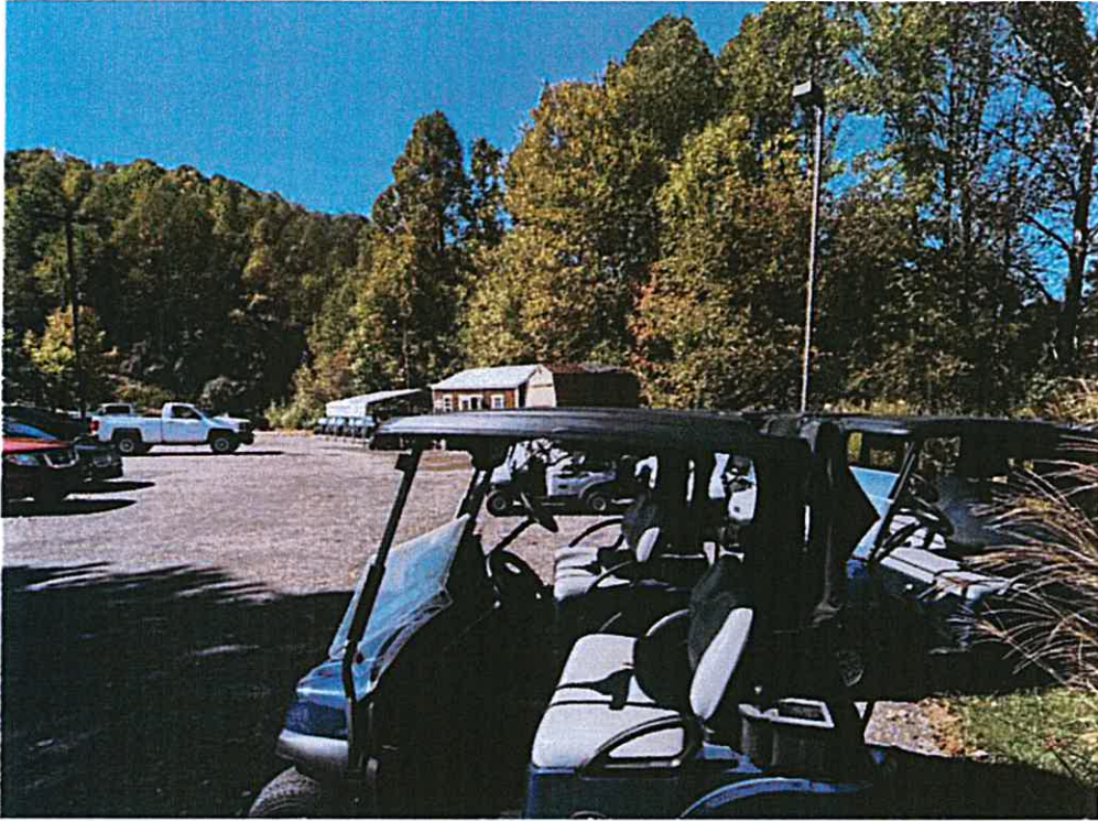
Photograph 11 – Adjacent Property, facing west.