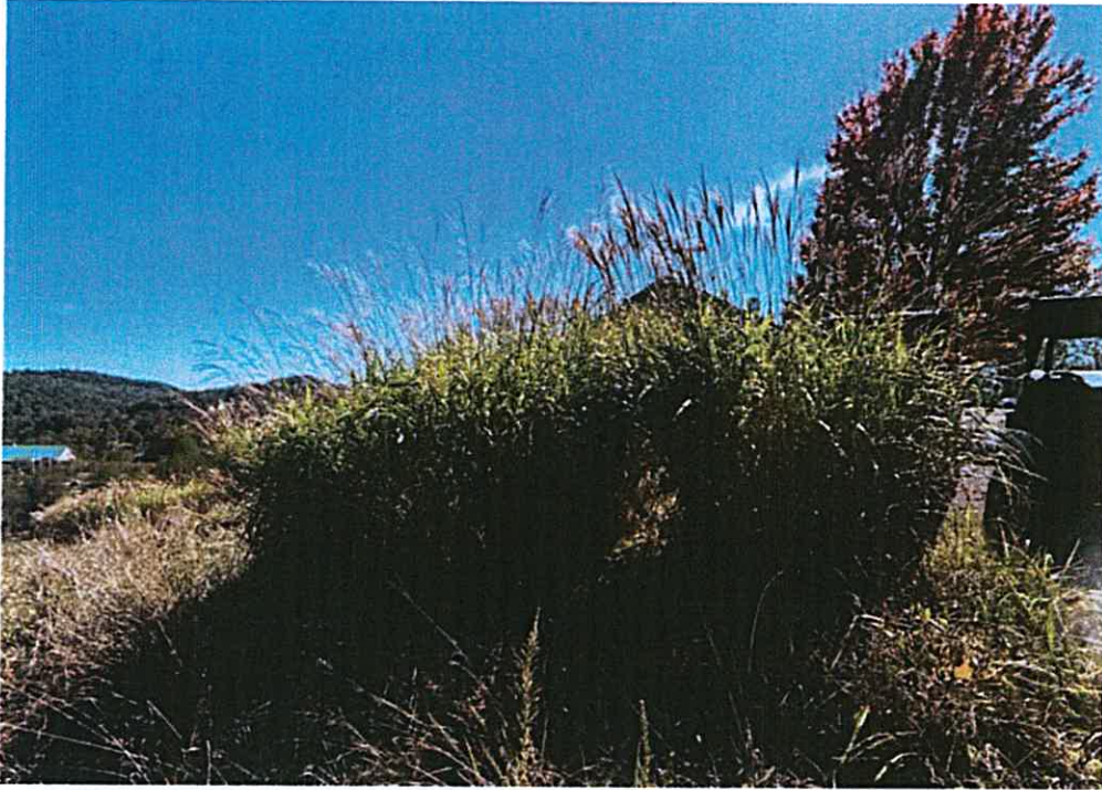
Photograph 3 – Subject Property, facing south.