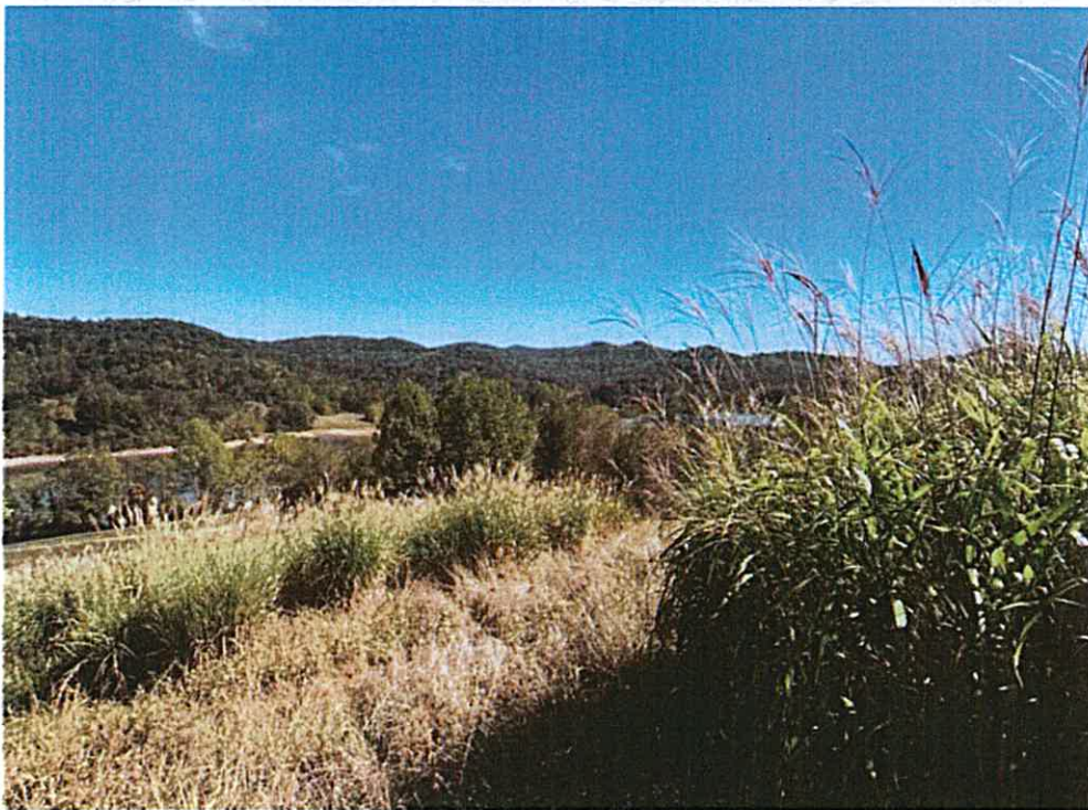
Photograph 8 – Adjacent Property, facing southeast.