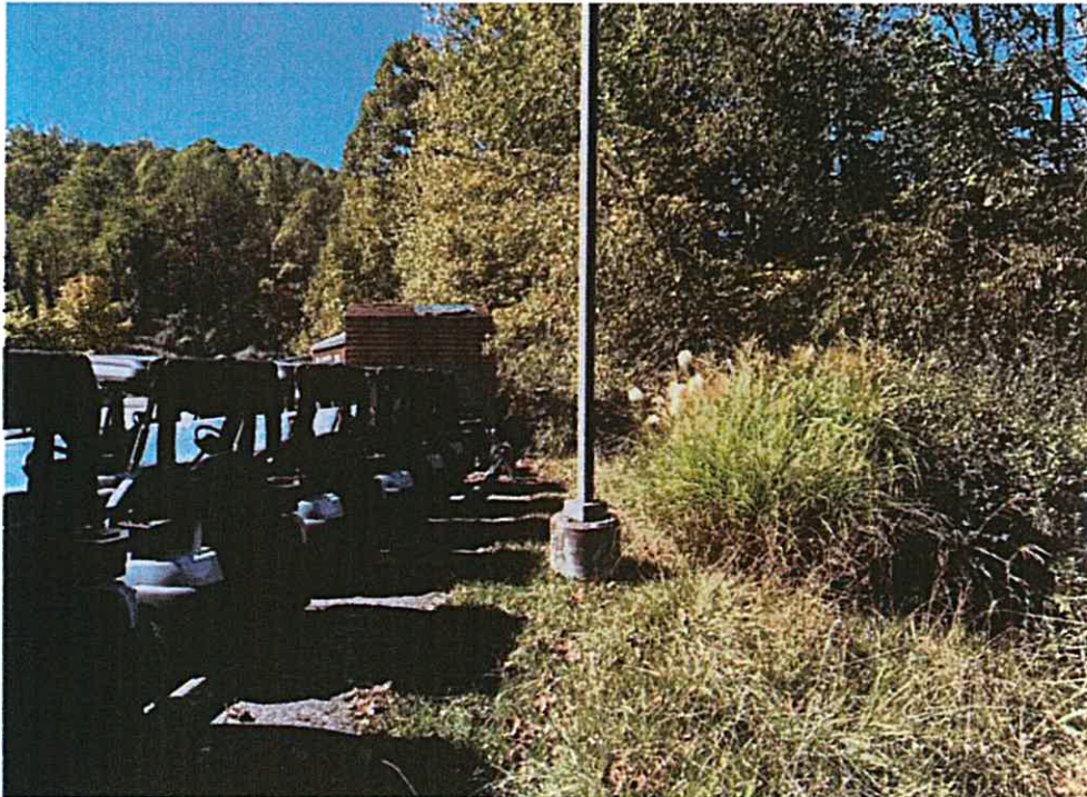
Photograph 12 – Adjacent Property, facing northwest.