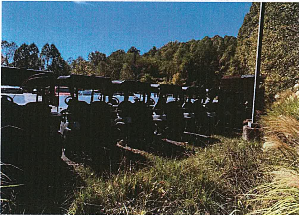
Photograph 4 – Subject Property, facing west.